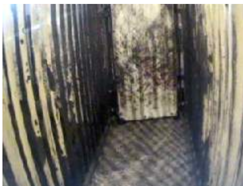
Blood-smear and spattered boar crate