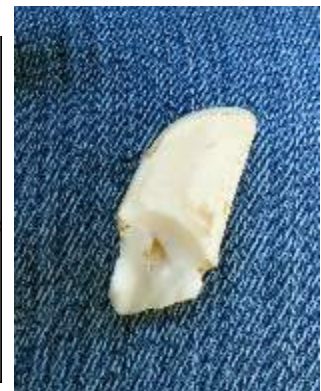
Remains of boar tooth showing innervated pulp canal