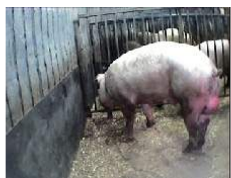
Flooring conditions very scant shavings -slippery