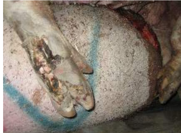
Exposed carpal bones; excised skin – bleeding wound