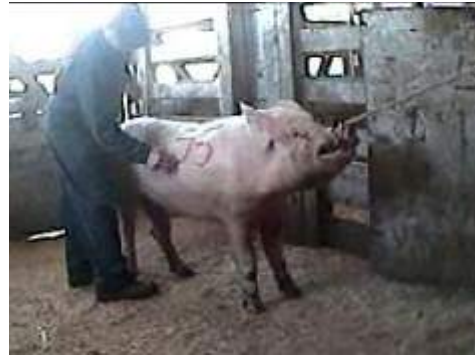
Having number written on back with marker