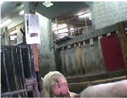
Sows with red, raw rears and sides