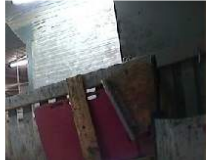
Unused plastic board, pipe used beside it