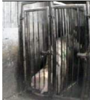
Boar in crate that is far too small