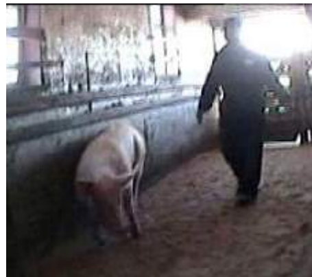
Boar post tooth-breaking, being run back to stall