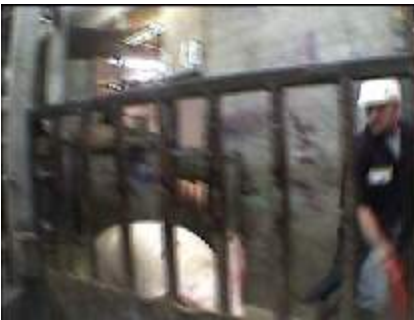
Sow being beaten on face