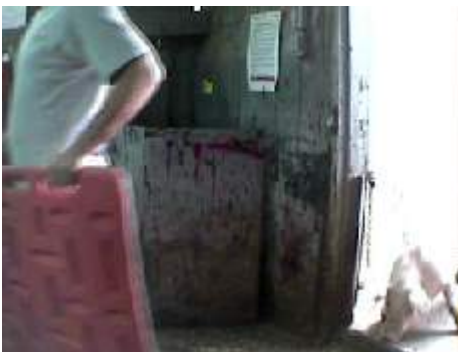
Pig slipping on floor & barrier that must be crossed