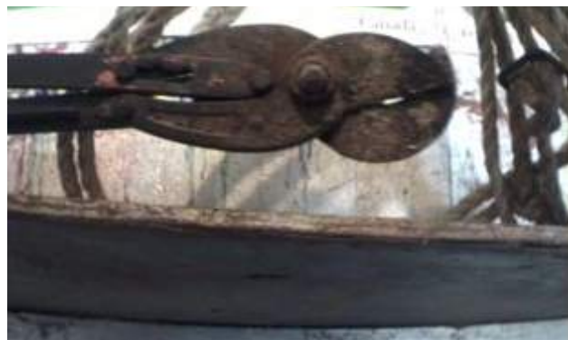
Bolt-cutters and rope used