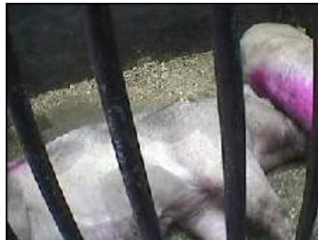
Unusual bruising on dead pig