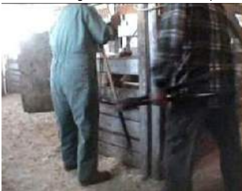
Worker entering pen with bolt-cutters