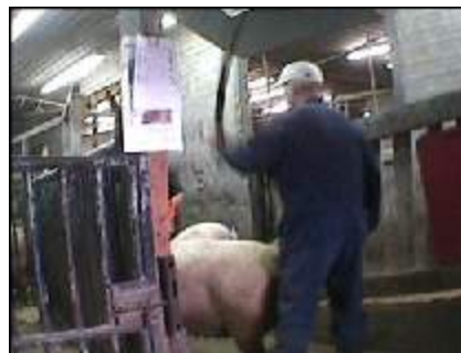
Pigs about to be beaten with pipe