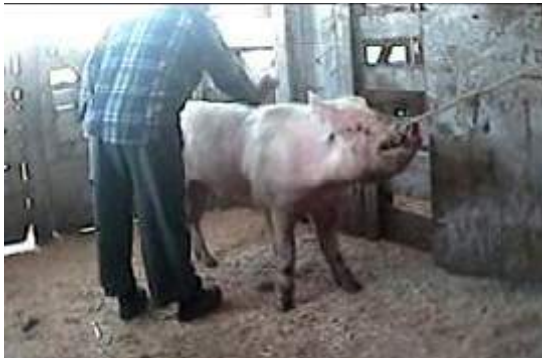
Having green sticker slapped on

Ottawa Livestock Exchange/Leo's Livestock Exchange cont'd: