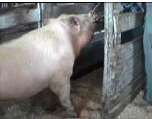
Bolt-cutters placed on lower incisor, closed and twisted away