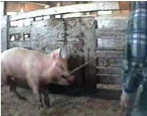
Boar struggling to escape lasso