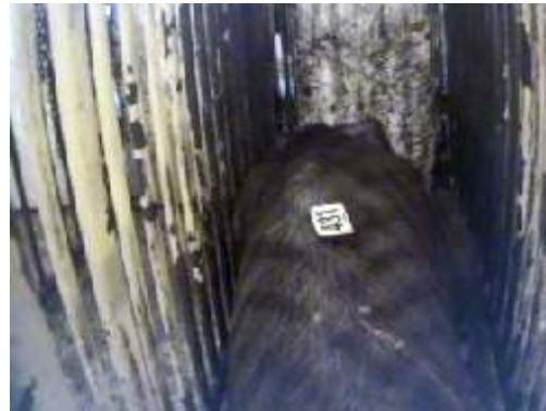
Different boar in small, blood-smear crate

It must be stated that the anatomy of a boar's tusk is simply that of an elongated incisor, meaning it contains a living pulp, which contains blood vessels, lymphatics and nerves. According to the tooth remains left on the floor, one that was retrieved (pictured to the far right) and what we witnessed, the bolt-cutters are cutting directly through this very sensitive pulp. This surely constitutes extreme and unnecessary cruelty.