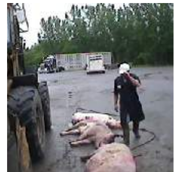
Worker smoking while handling pigs

What we saw on this visit, together with the inexplicable condition of the dead pigs in the garbage bins outside, as well as the number of dead produced in this facility daily gives us great concern about treatment of these already health-compromised cull pigs (sows and boars).