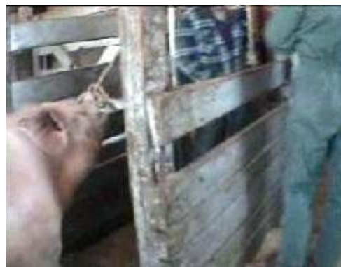
Boar immediately after tooth breaking