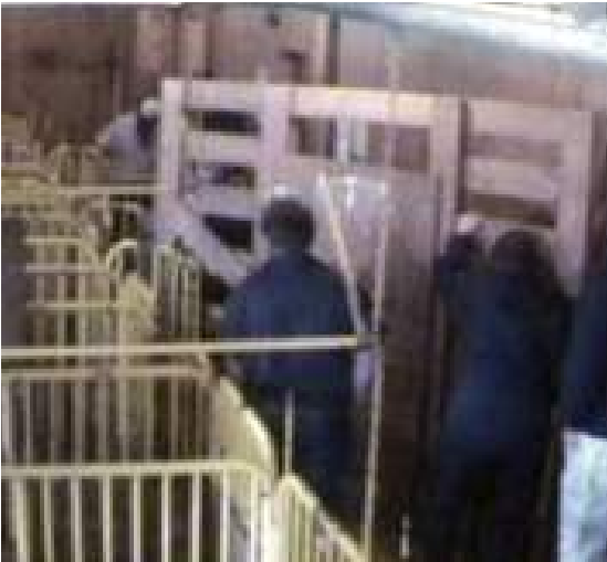
Worker kicking sow as 2 CFIA inspectors watch

Ottawa Livestock Exchange/Leo's Livestock Exchange cont'd