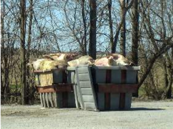
Two bins full of dead pigs

Both bins were full to the brim with dead pigs on this day – at least 12 animals. The pigs inside the bins were in very bad, inexplicable condition. Many had large chunks of skin cut away. This was especially concerning as the wounds had been bleeding, meaning the cuts had been done peri-mortem or pre-mortem (around the time of death or before death). One pig had a bleeding snout and one sow appeared to have been dragged on her back for so long that the skin was worn away from the back of her fore limb, exposing the wrist bones.